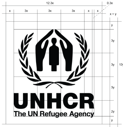
UNHCR Vertical Visibility logo